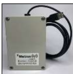
USB receiver unit